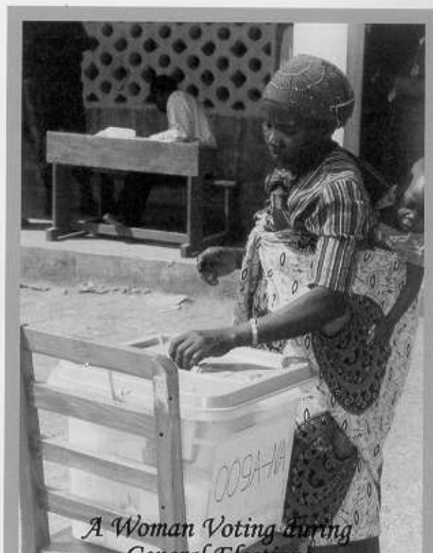
A Woman Voting during General Elections